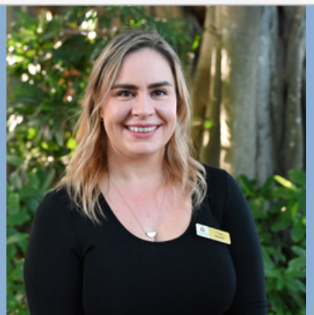
Head of Vocational Education & Careers