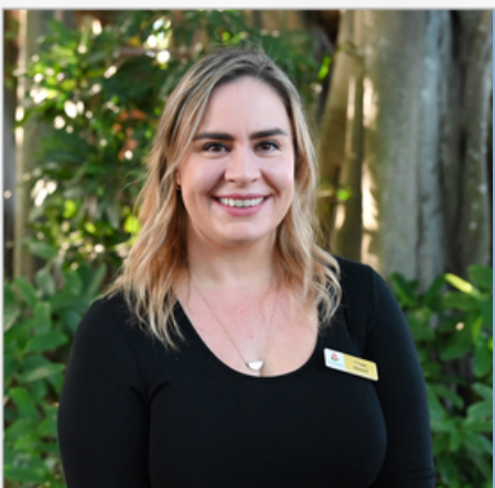
Head of Vocational Education & Careers