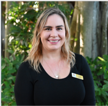
Head of Vocational Education & Careers

If you or your child have any questions about Vocational Education and Training, Work Experience or Career pathways, you can book an appointment on the RGS Careers Website.